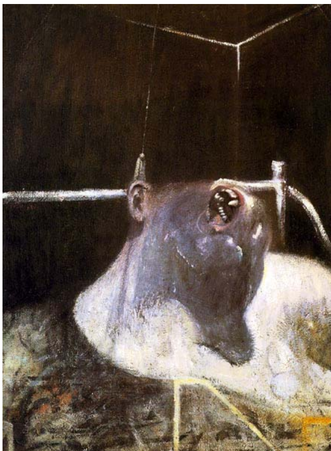
Head I (1948)