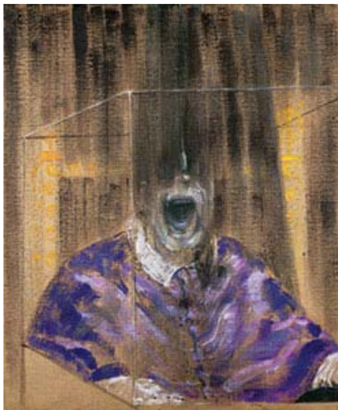
Head VI (1949)